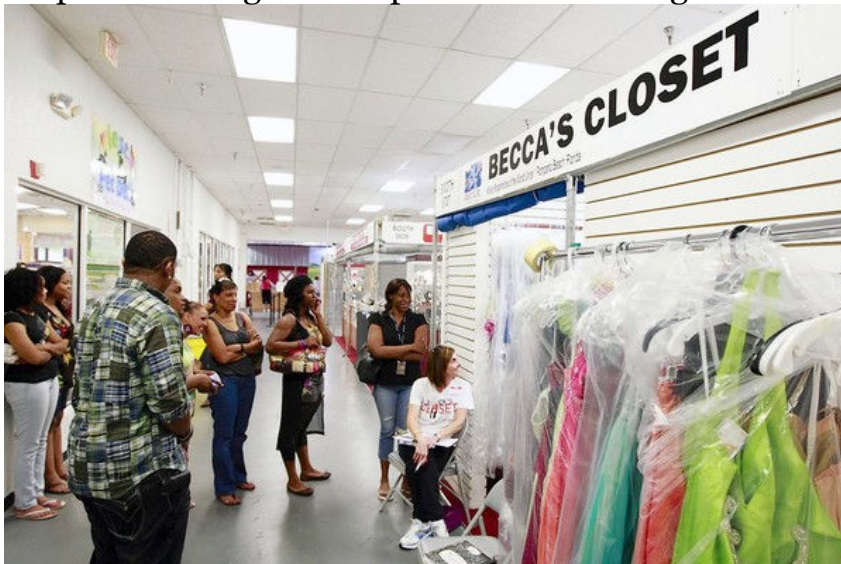
Mothers and daughters watch the other girls try on prom dresses while awaiting their turns at Becca's Closet in the Festival Flea Market Mall in Pompano Beach. (Eric Bojanowski, FPG / May 14, 2010)