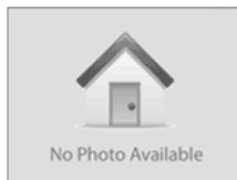
$295,000, 3 bedroom, 1 full bath 3 half-baths, 3393