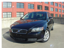
2005 Volvo S40 2.4i. Black,